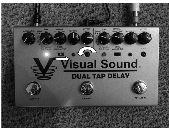
Rolled Off Tap Delay