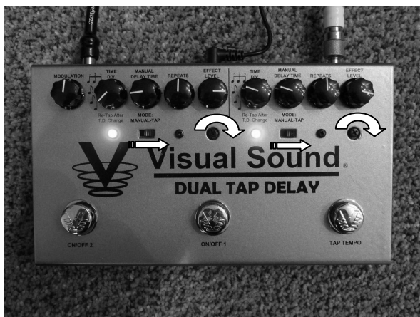
Edgy Dual Delay

There are an endless variety of settings to experiment with and use with the Visual Sound Dual Tap Delay. Here are just a few to get you started. As you will soon find out, there is really not a bad setting to be found with this pedal. Enjoy!